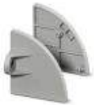
Flange cover, Color: gray