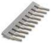
Insertion bridge, Number of positions: 10, Color: gray