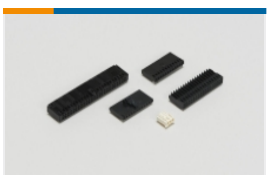
Wire-to-Board Connector Assemblies & Housings(5)