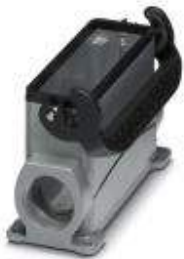
HEAVYCON box mounting base B24, with single locking latch, height 84 mm, with support 1x M32

Please be informed that the data shown in this PDF Document is generated from our Online Catalog. Please find the complete data in the user's documentation. Our General Terms of Use for Downloads are valid ( http://phoenixcontact.com/download )