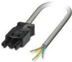
Power cable, 3-position, PVC, gray RAL 7001, free cable end, on Socket straight, black, Cable length: 3 m

Please be informed that the data shown in this PDF Document is generated from our Online Catalog. Please find the complete data in the user's documentation. Our General Terms of Use for Downloads are valid ( http://phoenixcontact.com/download )