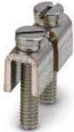
Fixed bridge, pitch: 12 mm, number of positions: 2, color: silver

Please be informed that the data shown in this PDF Document is generated from our Online Catalog. Please find the complete data in the user's documentation. Our General Terms of Use for Downloads are valid ( http://phoenixcontact.com/download )