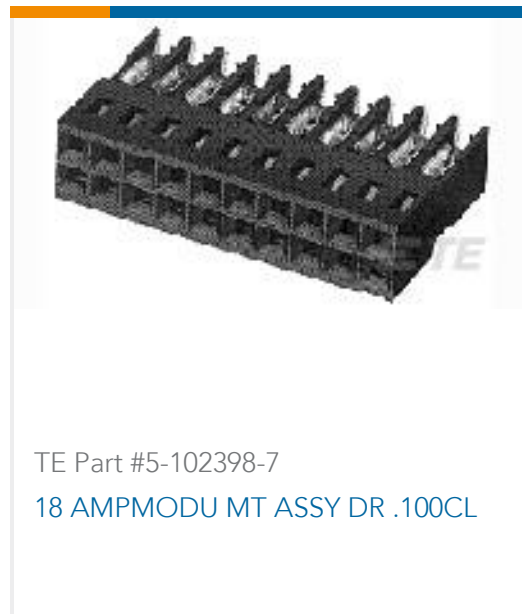
TE Part #5-102398-7 18 AMPMODU MT ASSY DR .100CL