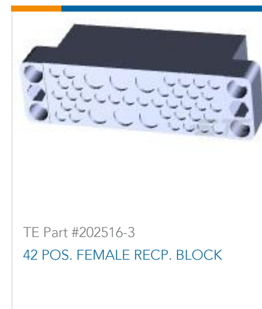
TE Part #202516-3 42 POS. FEMALE RECP. BLOCK