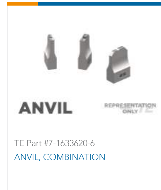
ANVIL REPRESENTATION ONLY TE Part #7-1633620-6 ANVIL, COMBINATION