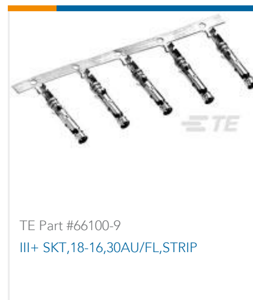
TE Part #66100-9 III+ SKT,18-16,30AU/FL,STRIP