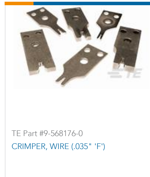
TE Part #9-568176-0 CRIMPER, WIRE (.035" 'F')