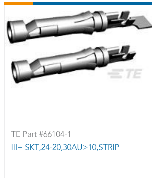
TE Part #66104-1 III+ SKT,24-20,30AU>10,STRIP