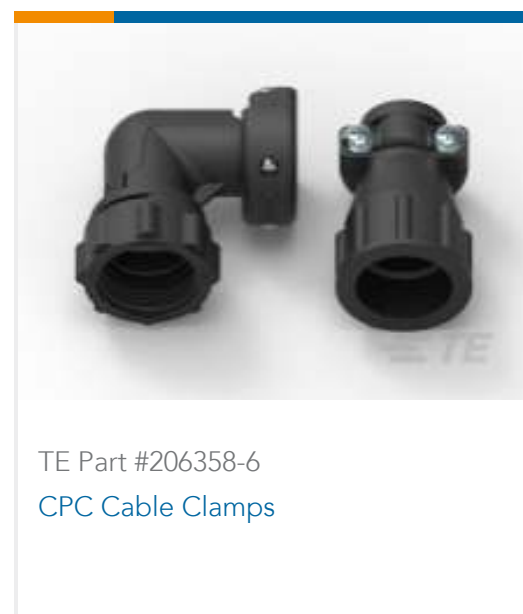
TE Part #206358-6 CPC Cable Clamps