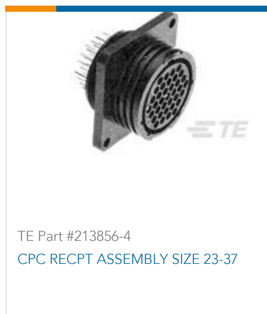
TE Part #213856-4 CPC RECPT ASSEMBLY SIZE 23-37