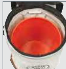
14" diameter accommodates standard 5 gallon bucket.

⚠ WARNINGS: Completely close top before each use.