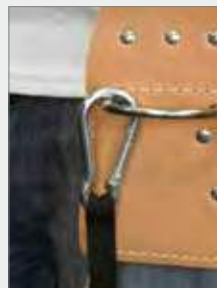
Always use a load bearing anchor or attachment point