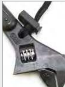
Attach tether through tether hole when available