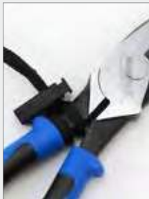
Always use choke hitch formation