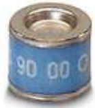
Reserve gas-filled surge arrester for RF-TRAB

Please be informed that the data shown in this PDF Document is generated from our Online Catalog. Please find the complete data in the user's documentation. Our General Terms of Use for Downloads are valid ( http://phoenixcontact.com/download )