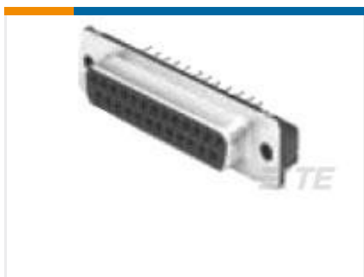
TE Part #2-747708-0 25 RCPT SP/FMS BRDLK