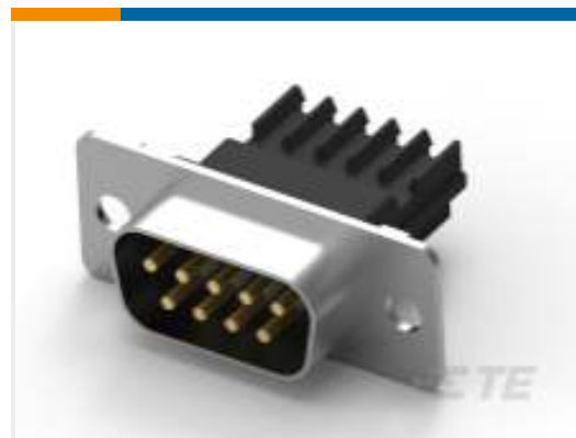
TE Part # CAT-AM7-248H3 IDC D-Sub: Plug Assembly, Wire to Wire, Signal, 2.77 mm