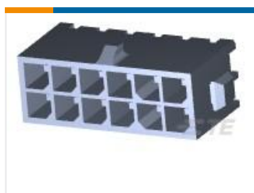
TE Part #4-794632-2 12P MICRO MNL ASSY,VRT,HDR,LF