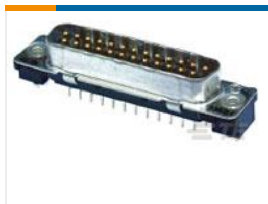
TE Part #2-5747704-0 25 PLUG SP/FMS BRDLK