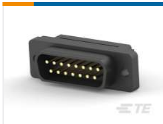
TE Part # CAT-AM7-H3 IDC D-Sub: Plug Assembly, Low Profile, Signal, 2.77 mm