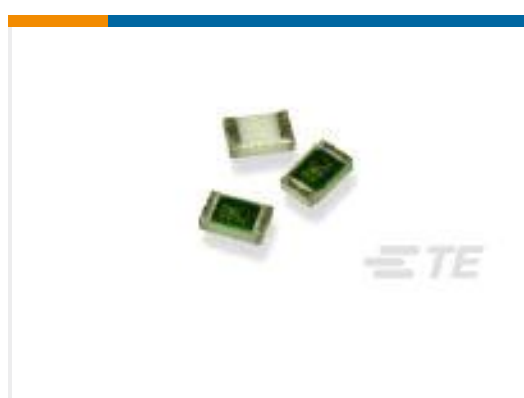
TE Part #7-1879211-9 CPF 0402 11K8 0.1% 25PPM 5K RL