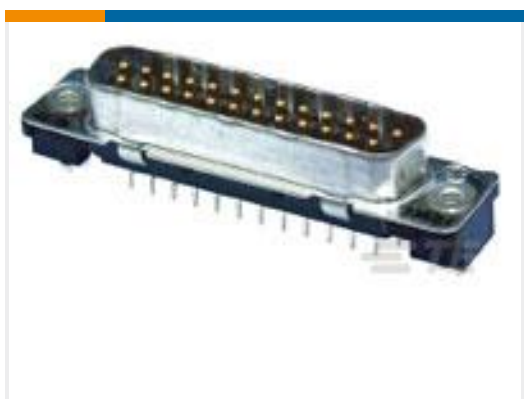
TE Part #5750638-1 15 PLUG SP/FMS BRDLK