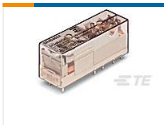
TE Part #6-1415054-1 SR4M4110