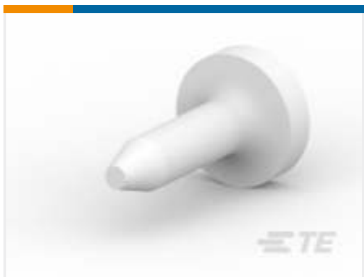
TE Part # 206509-1 SIZE 20 KEYING PLUG