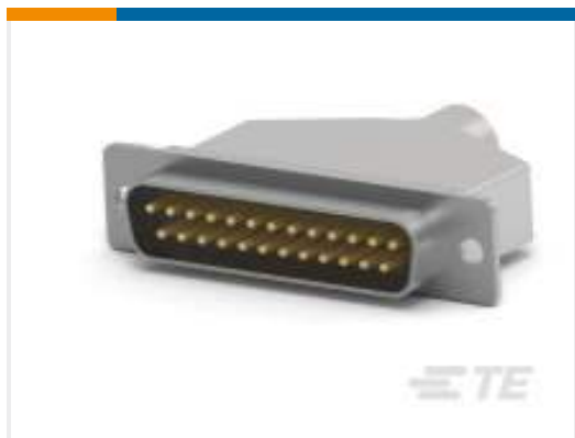
TE Part # CAT-AM7-248H4 IDC D-Sub: Connector Kit, Plug, Wire to Wire, Signal, 2.77 mm