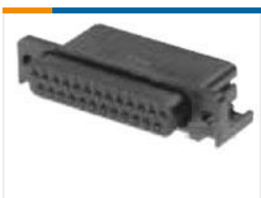
TE Part #5747462-2 HD-20 RCPT 37P RA 590