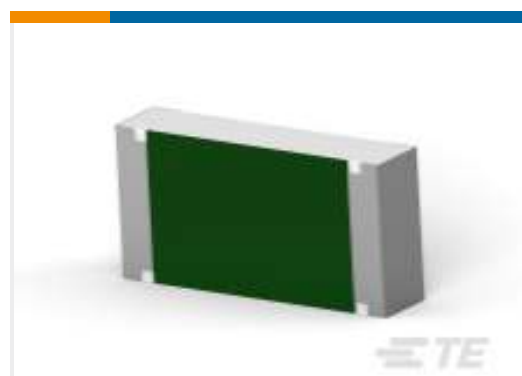
TE Part #8-2176398-2 3502 8R2 5%