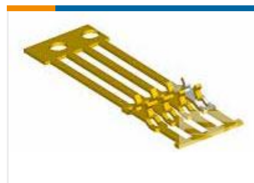
TE Part #1544425-1 CTS 254 BRONZE PRE