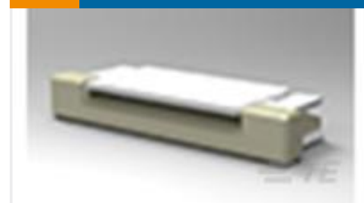
TE Part #1-1734839-0 FPC CONN. 0.5MM PITCH T/C,10P