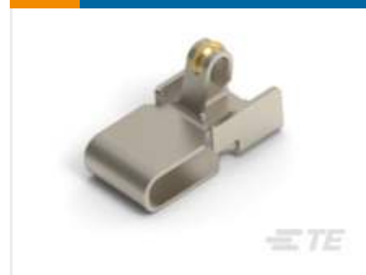
TE Part # 2199249-3 Shield Finger, Loose Piece, Type B, 2.0 h