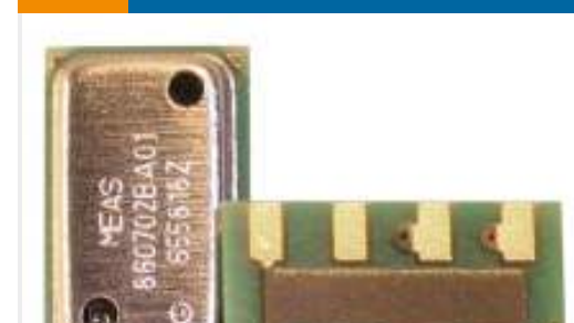
TE Part #MS860702BA01-50 PTH COMBINATION DIGITAL SENSOR