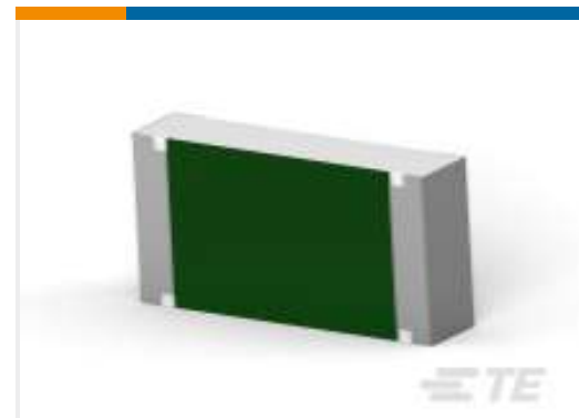
TE Part #7-2176398-5 3502 2R2 5%