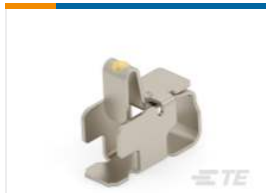
TE Part #2306454-3 SPRING FINGER 2.3H