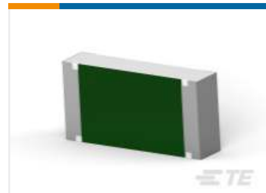
TE Part #1-2176397-0 3502 2R4 1%