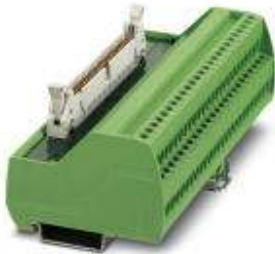
VARIOFACE interface module

Please be informed that the data shown in this PDF Document is generated from our Online Catalog. Please find the complete data in the user's documentation. Our General Terms of Use for Downloads are valid ( http://phoenixcontact.com/download )