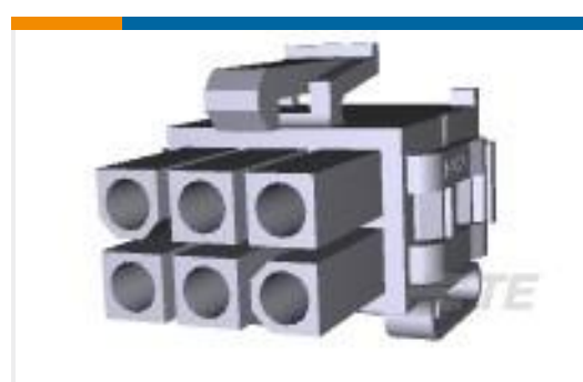
TE Part #794243-1 06P MINI UMNL2 PLUG HSG UL94V2