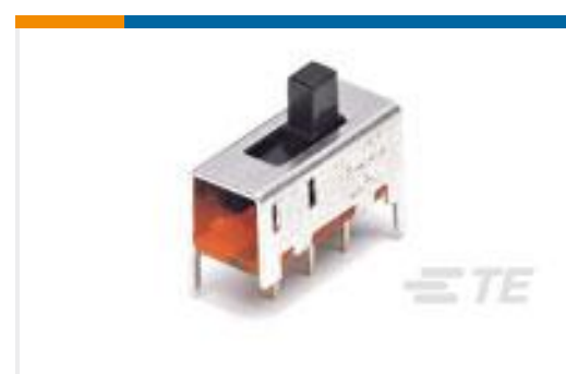
TE Part #1825267-1 MSS430004=4P3T SL SW AG