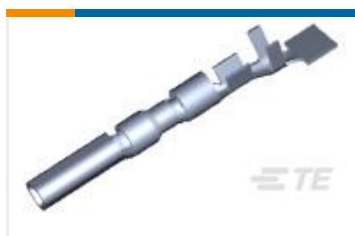
TE Part #1-794219-0 MINI UNML2 SOK 26-22 AWG AU LF