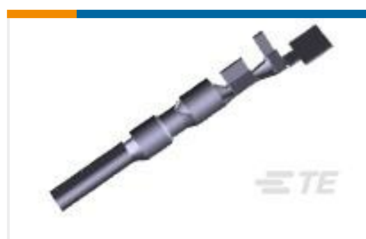
TE Part #1-794227-0 MINI UMNL2 SOK 26-22 AWG LP LF