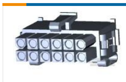
TE Part #794198-1 12P MINI UMNL2 PLUG HSG DBLROW