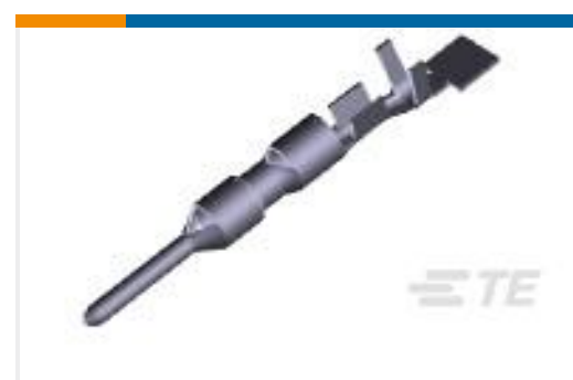
TE Part #1-794226-0 MINI UMNL2 PIN 26-22AWG LP LF