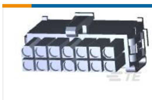
TE Part #794202-1 14P MINI UMNL2 PLUG HSG UL94V0