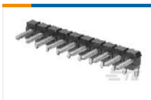
TE Part #826947-8 8P MOD2 STIFT LEI