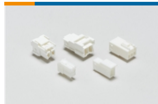
Rectangular Power Connectors(45)