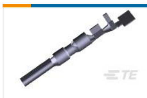
TE Part #794227-1 MINI UMNL2 SOK 26-22 AWG SN LP