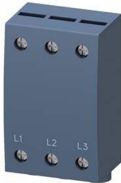
3-phase supply terminal for 3-phase busbar Size S0 and S00 connection from below