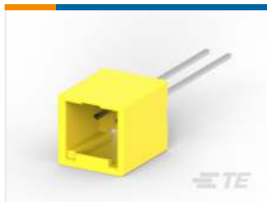
TE Part #3-2232546-3 STD Temp Sig GRACE INERTIA Header