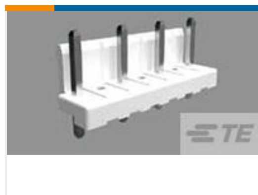
TE Part #5-1123724-4 3.96EP HDR ASSY 4(7)P BLACK