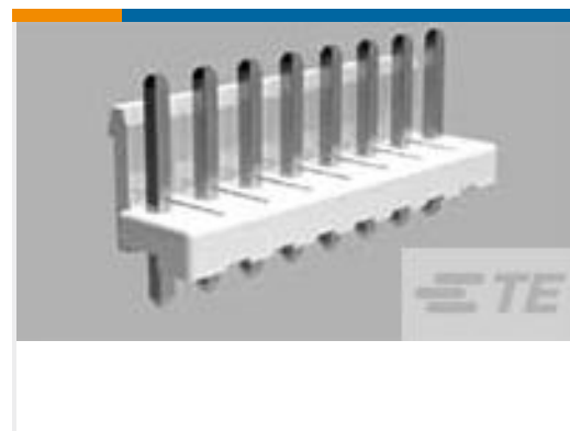
TE Part #4-1123723-6 3.96 EP HDR ASSY 6P(RED)