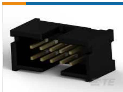
TE Part # 5104338-1 A/L LOW PRO HDR 10P VERT HT