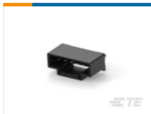
TE Part #6-1971798-5 NEW GI CONN2.5 HDR ASMBLY 6P BLK D1.0