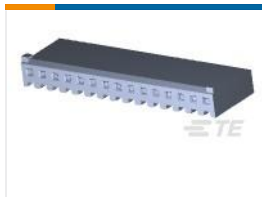
TE Part #1-647402-5 15P SL156 HSG W/RMP&TABS,OVSZ