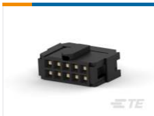
TE Part # 1658621-1 10 NOVO MIL/CTR 15DP, LEAD FREE