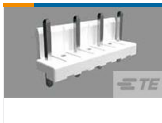
TE Part #6-1123724-4 3.96EP HDR ASSY 4(7)P GREEN