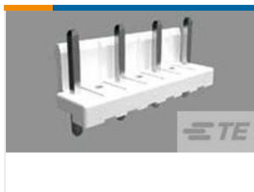
TE Part #6-1123724-2 3.96EP HDR ASSY 2(3)P GREEN