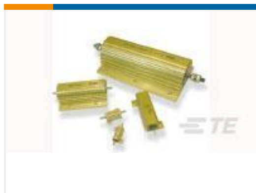
TE Part #2-1630012-8 HSC150 22R 5%