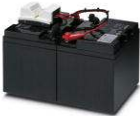
Energy storage device, lead AGM, VRLA technology, 24 V DC, 38 Ah, automatic detection, and communication with QUINT UPS-IQ

Please be informed that the data shown in this PDF Document is generated from our Online Catalog. Please find the complete data in the user's documentation. Our General Terms of Use for Downloads are valid ( http://phoenixcontact.com/download )