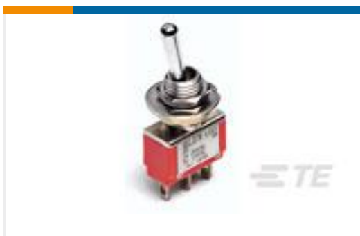
TE Part #3-1825138-7 A208SYCQ04