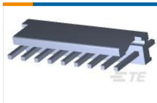
TE Part #644752-9 09P MTA156 HDR ASSY SQ STR F/L