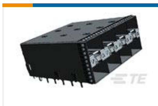
TE Part #1-2007394-7 SFP+ assy 2x4 EMI Spg Outer LP Sn Enhanc