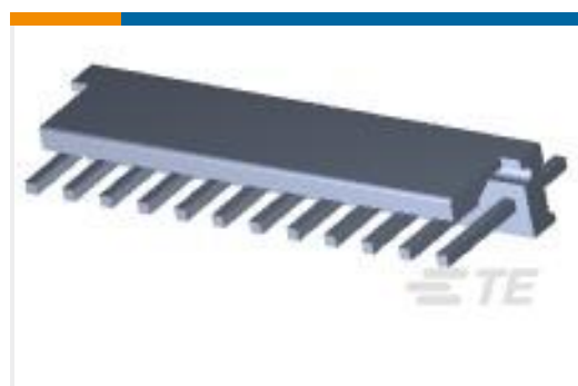
TE Part #1-644752-2 12P MTA156 HDR ASSY SQ STR F/L