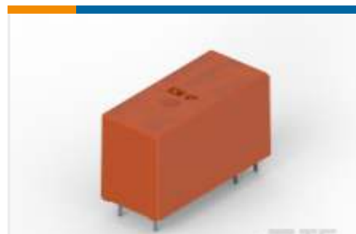
TE Part #8-1415898-6 RTSETA12