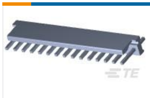
TE Part #1-644752-5 15P MTA156 HDR ASSY SQ STR F/L