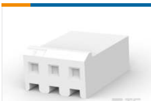
TE Part #647401-2 Receptacle Housing: Wire-to-Board, with Mating Alignment, SL156