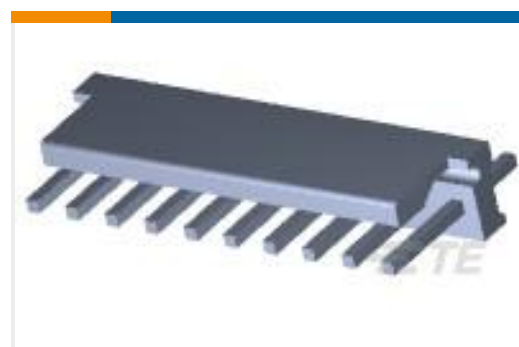
TE Part #1-644752-0 10P MTA156 HDR ASSY SQ STR F/L