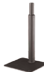
Model: 960-09 Mount Stand, 9" (203.2mm)

Click on any of the above images to find out more about the products pictured.