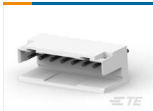
TE Part #292173-5 AMP COMMON TERMINATION HEADERS