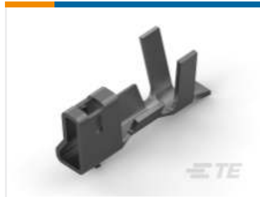
TE Part # CAT-AM7017-C7671 Common Termination Contacts — POWER TRIPLE LOCK