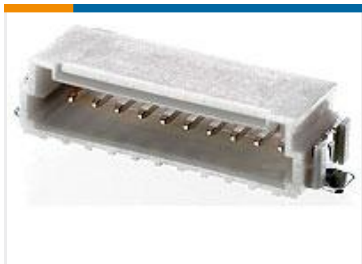
TE Part #292227-4 1.5 MINI CT SGL H SMT W BOSS 4