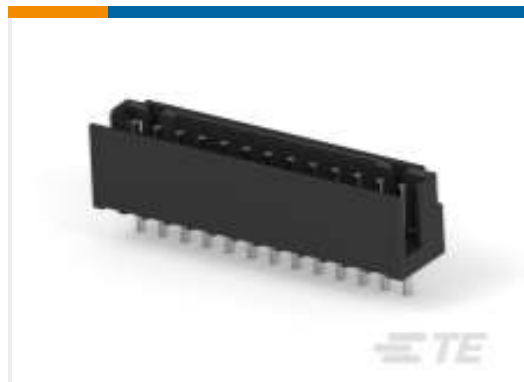
TE Part #292132-5 CT 2mm Post Header Asbly: Box V DIP