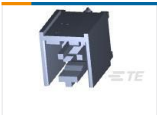
TE Part #2-647127-2 02P MTA156 SHRD HDR ASSY LF