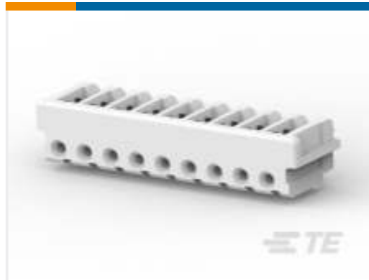
TE Part # CAT-AM7017-H8172 AMP COMMON TERMINATION HOUSINGS