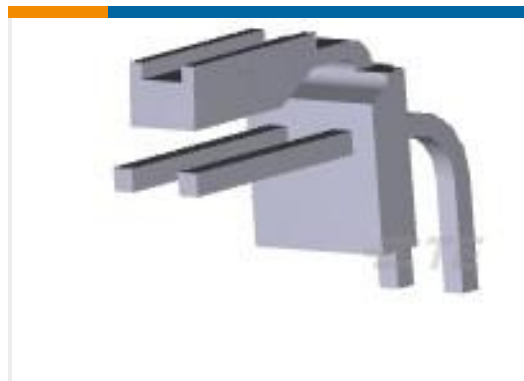
TE Part #3-644613-2 02P MTA156 HDR RA PO WO PEG LF