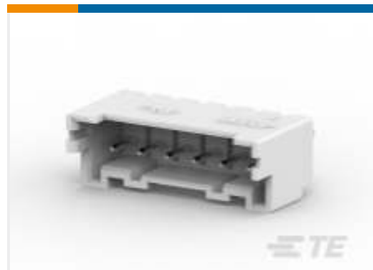
TE Part #1969730-6 EP2.5 SHROUDED HDR ASSY 6P VERTICAL