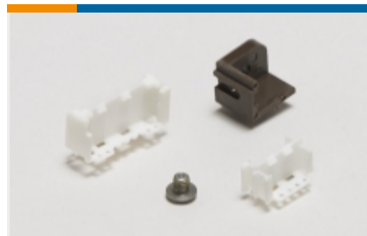
PCB Connector Mounting(46)