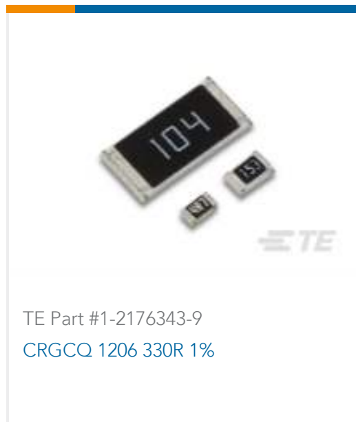
TE Part #1-2176343-9 CRGCO 1206 330R 1%