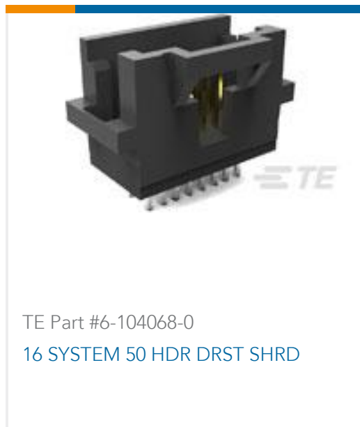
TE Part #6-104068-0 16 SYSTEM 50 HDR DRST SHRD