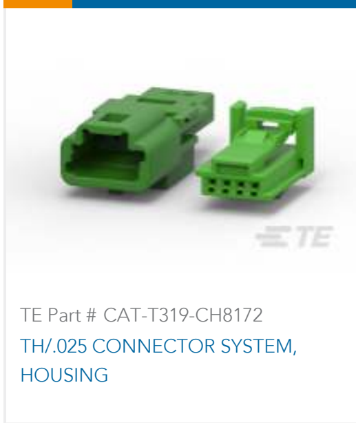
TE Part # CAT-T319-CH8172 TH/.025 CONNECTOR SYSTEM, HOUSING