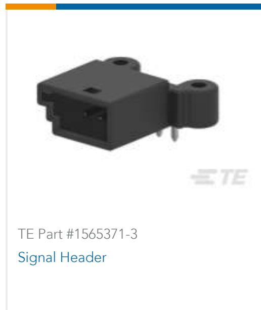
TE Part #1565371-3 Signal Header