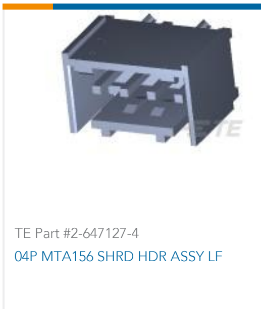
TE Part #2-647127-4 04P MTA156 SHRD HDR ASSY LF