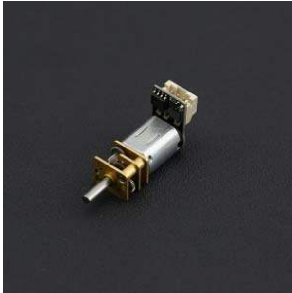
Micro Metal DC Geared Motor w/Driver