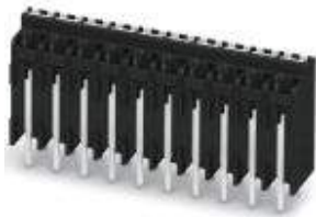
The illustration shows the 10-position version

Please be informed that the data shown in this PDF Document is generated from our Online Catalog. Please find the complete data in the user's documentation. Our General Terms of Use for Downloads are valid ( http://phoenixcontact.com/download )