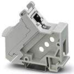
Patch panel, RJ45, DIN rail mounting, IP20, 1 slot, IDC connection, CAT6 A

Please be informed that the data shown in this PDF Document is generated from our Online Catalog. Please find the complete data in the user's documentation. Our General Terms of Use for Downloads are valid ( http://phoenixcontact.com/download )