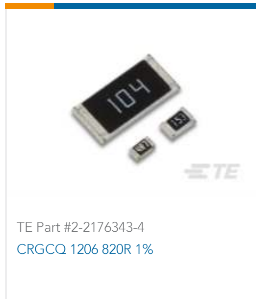
TE Part #2-2176343-4 CRGCQ 1206 820R 1%