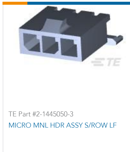
TE Part #2-1445050-3 MICRO MNL HDR ASSY S/ROW LF