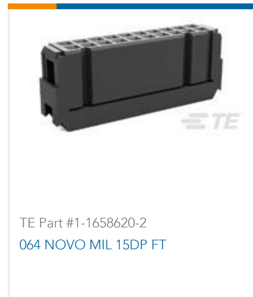
TE Part #1-1658620-2 064 NOVO MIL 15DP FT