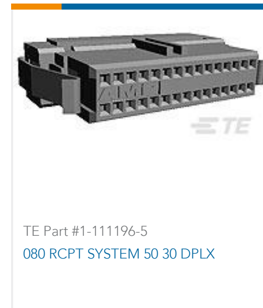
TE Part #1-111196-5 080 RCPT SYSTEM 50 30 DPLX