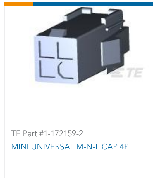
TE Part #1-172159-2 MINI UNIVERSAL M-N-L CAP 4P