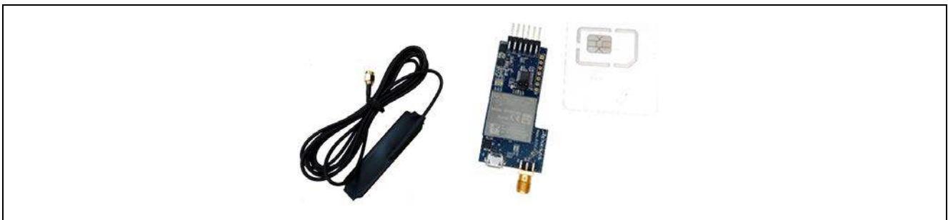
Figure 1. Kit Contents