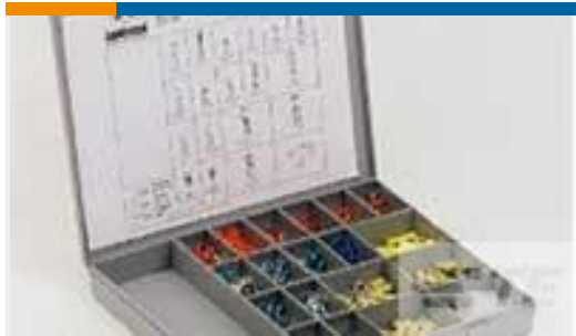
TE Part # 165346 PIDG/PG. INTRO.KIT