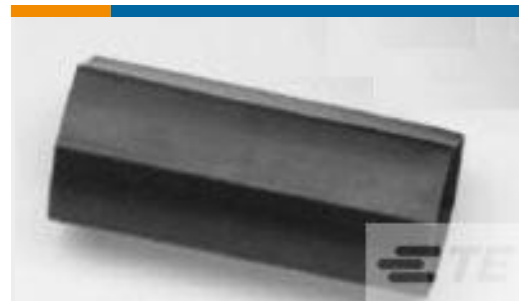
TE Part #CB5155-000 HRSR-250FR-10