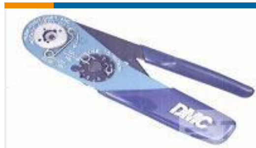
TE Part #601966-1 CRIMPING TOOL M22520/2-01