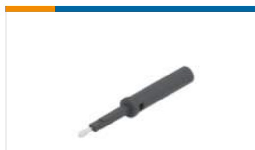
TE Part #1SNK900205R0000 TP4