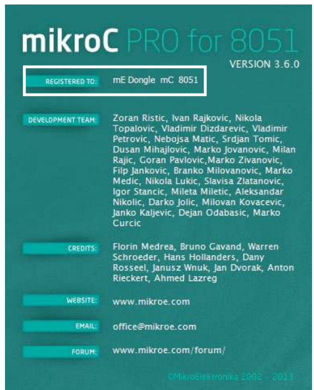
Figure 2: mikroC PRO for 8051 About window