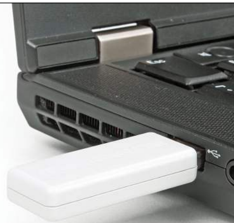
Figure 3: USB Dongle plugged into Laptop USB host connector

Unfortunately not. If you lose your dongle you will need to buy a new compiler license and pay the full price.