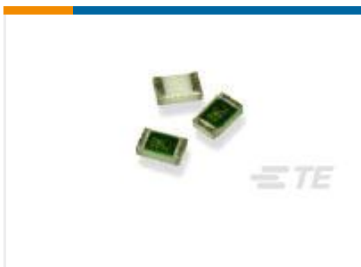
TE Part #9-1879208-4 CPF 0402 75K 0.1% 25PPM 1K RL