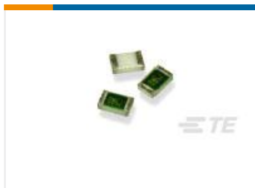
TE Part #7-1676481-4 CPF 0603 7K5 0.1% 25PPM 1K RL