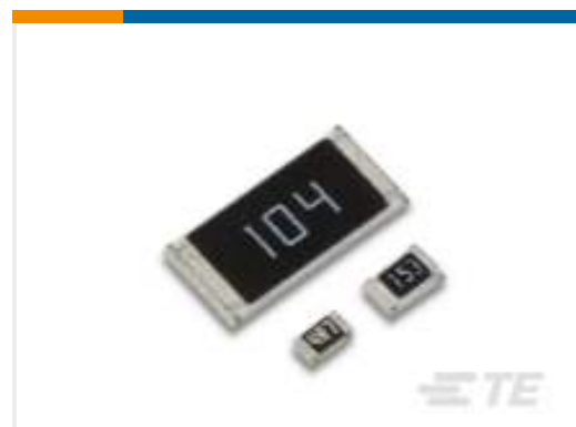
TE Part #6-2176347-0 CRGCQ 2010 820K 1%