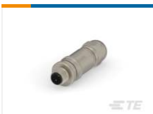
TE Part #T4111411021-000 M12 M, 2P GOLD B_CODE S SHIELDED PG7