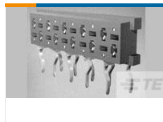
TE Part # 7-100400-4 NOT POLARIZED,BOX A 250ST