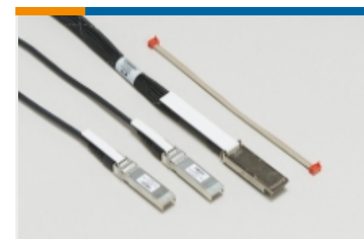
Pluggable I/O Cable Assemblies(52)