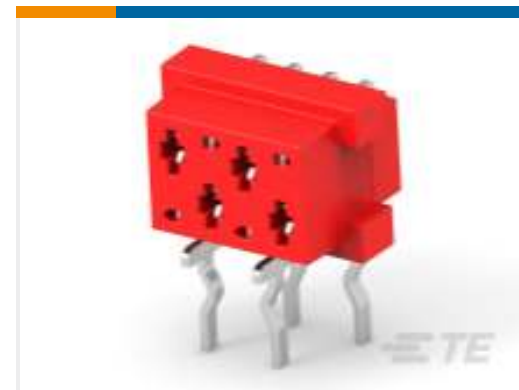
TE Part # 215460-4 MICRO-MATCH FEM.SE