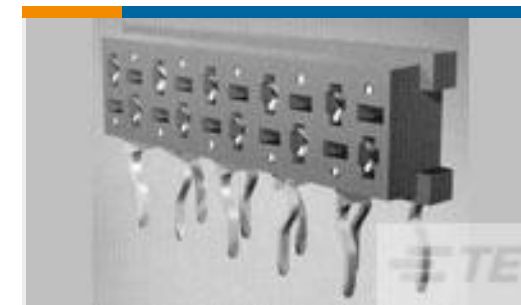
TE Part # 100400-4 MICRO-MATCH FSID NP