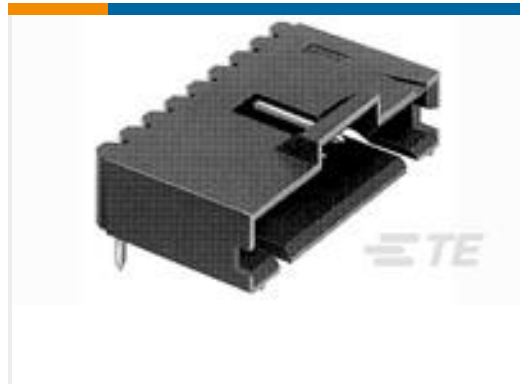
TE Part #5-103634-5 06 MTE HDR SRRA LATCH.100CL LF