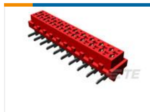
TE Part # 7-188431-4 MM 4P FIB SMD CONNECTOR