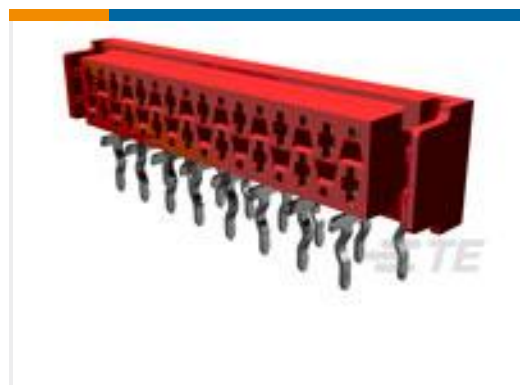
TE Part #338070-4 MICRO-MATCH FEM.SE