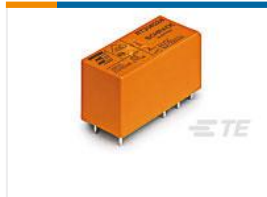
TE Part #4-1415536-2 RTHH4012WG