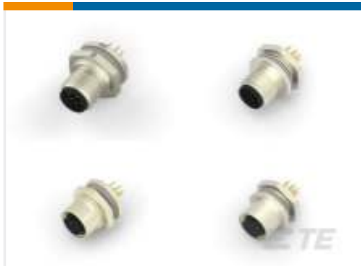
TE Part #T4145035031-001 M12 Panel Mount PCB