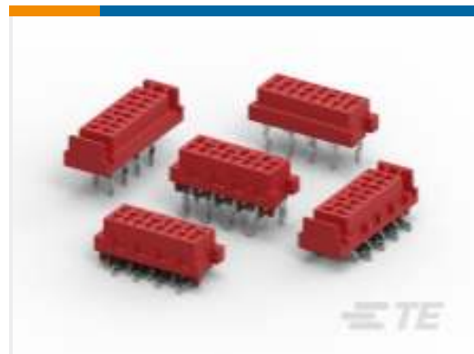
TE Part # CAT-M5833-F3492A Female-on-Board Connector, Top Entry