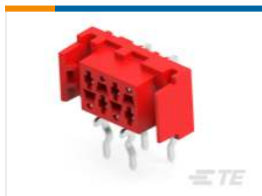
TE Part # 338070-4 MICRO-MATCH FEM.SE