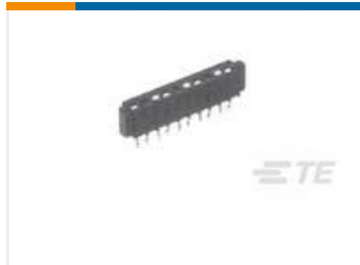
TE Part #5-520315-7 TRIOMATE ASSY V 7P L=3.556