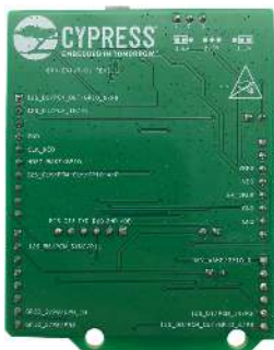
Figure 2: CYBT-353027-EVAL Bottom View

SW1: Reset Switch routed to the XRES connection on the module.