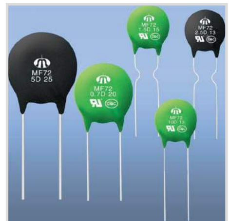
Power NTC Thermistor

Supplying high-quality bimetal and thermal sensor products.