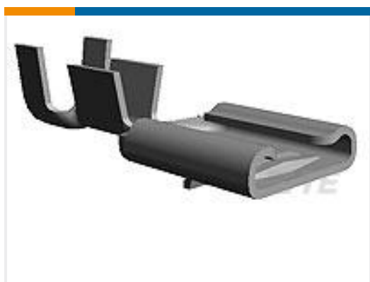
TE Part #62572-1 FF 110 REC 20-16AWG BR