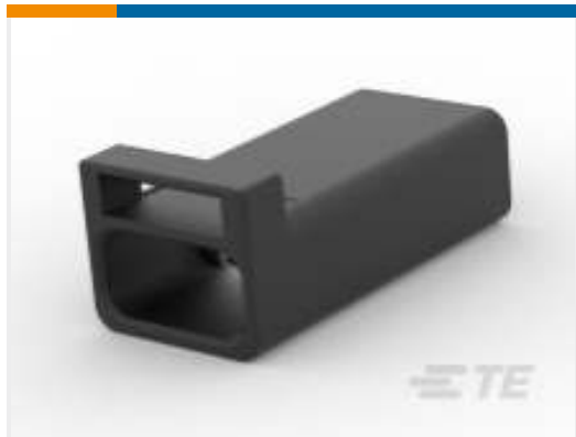
TE Part #1-2834075-2 SlimSeal Miniature Receptacles