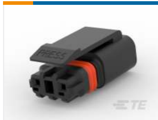
TE Part #2-2834074-2 SlimSeal Miniature Plugs