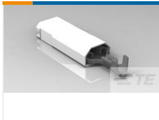
TE Part #521368-2 ULTRA-POD 250 ASSY REC 22-18 AWG TPBR