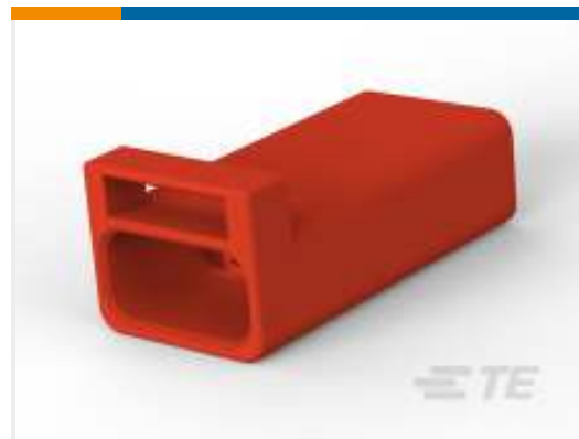
TE Part # 3-2834075-3 3P REC, MINIATURE WATERPROOF CONN.RED