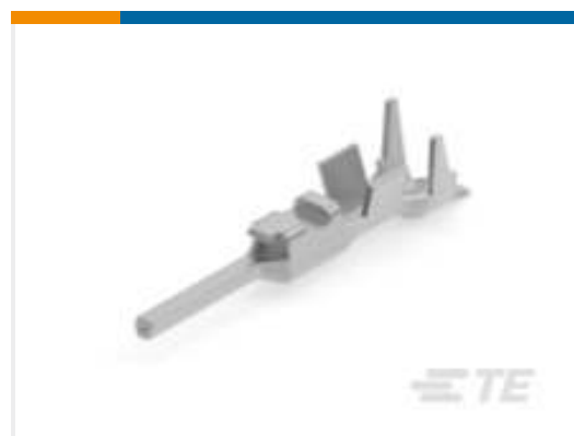
TE Part #1-2834068-2 PIN CONTACT,MINIATURE WATERPROOF CONN