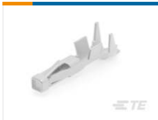
TE Part # 1-2834067-2 SOCKET CONTACT,MINIATURE WATERPROOF CONN