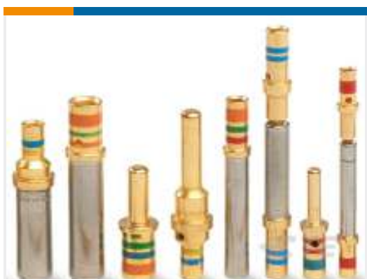
TE Part #ZPF000000000000545 020-0008-20