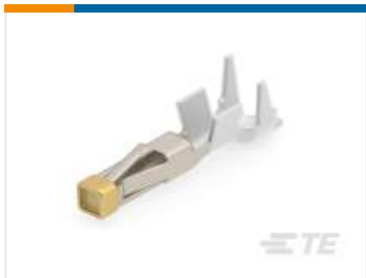
TE Part # 1-2834067-3 SOCKET CONTACT,MINIATURE WATERPROOF CONN