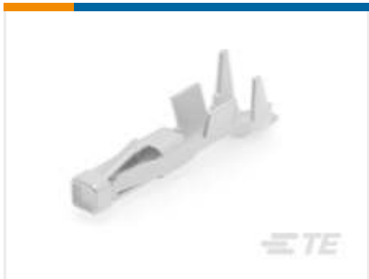
TE Part #1-2834067-2 SOCKET CONTACT,MINIATURE WATERPROOF CONN