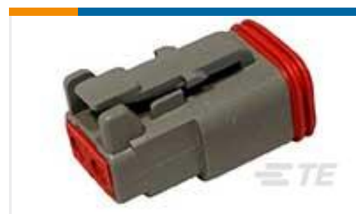
TE Part #DT06-2S PLG, 2P, GRY, N