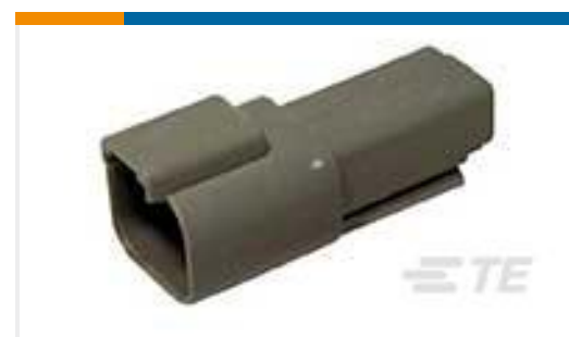
TE Part #DT04-2P REC, 2P, GRY, N