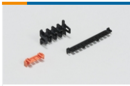
Rectangular Connector Locking(14)