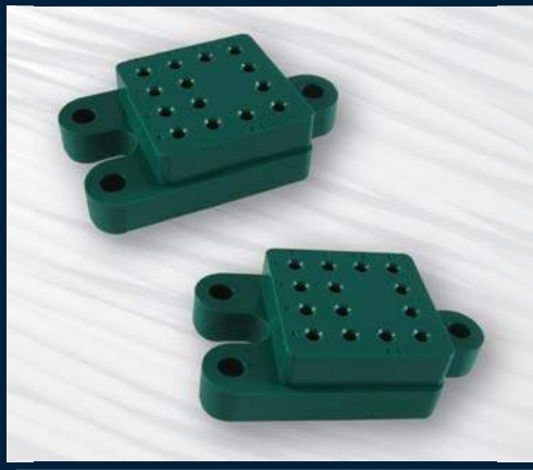
Mates with MIL-R-6106 & MS27743 Relays