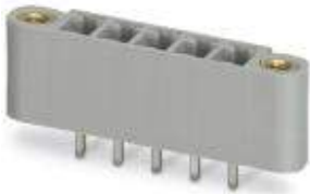
The figure shows the 5-pos. version of the product in gray

Header, Nominal current: 8 A, Rated voltage (III/2): 160 V, Number of positions: 20, Pitch: 3.81 mm, Color: black, Contact surface: Tin, Mounting: Wave soldering