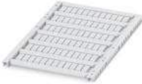
The figure shows the UCT2-TM 5/6 version

Marker for terminal blocks, can be ordered: by sheet, white, labeled according to customer specifications, Mounting type: Snap into tall marker groove, for terminal block width: 5.2 mm, Lettering field: 4.2 x 8.4 mm