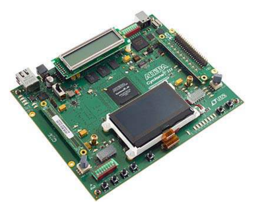
Figure 2 shows the data conversion HSMC.