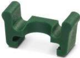
Replacement limit stop

Please be informed that the data shown in this PDF Document is generated from our Online Catalog. Please find the complete data in the user's documentation. Our General Terms of Use for Downloads are valid ( http://download.phoenixcontact.com )