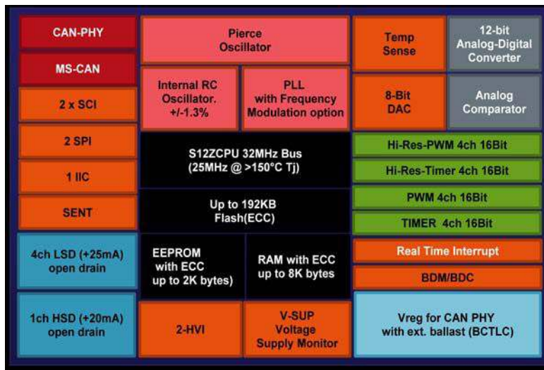
Figure 1. S12ZVC architecture diagram1

Some members of the MC9S12ZVC family are also offered for high temperature applications requiring AEC-Q100 Grade 0 (-40°C to +150°C ambient operating temperature range). The MC9S12ZVC family is based on the enhanced performance, linear address space S12Z core and delivers an optimized solution with the integration of several key system components into a single device, optimizing system architecture and achieving significant space savings.