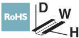
Figure shows PLC-BSC-120UC/21-21/SO46 version

14 mm PLC basic terminal block with spring-cage connection, without relay or solid-state relay, for mounting on DIN rail NS 35/7,5, 2 PDTs, input voltage 12 V DC