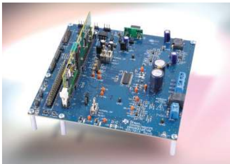
▲ Medium Voltage Digital Motor Control Kit for Stellaris LM4F MCUs (DK-LM4F-DRV8312)

The operation of both solutions can be controlled and viewed across a USB interface using an included GUI. Follow the steps in the DK-LM4F-DRV8312 kit's README First document to quickly get up and running.