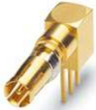
Coaxial contact, for D-SUB combination inserts, for PCB assembly, pin, angled, gold-plated

Please be informed that the data shown in this PDF Document is generated from our Online Catalog. Please find the complete data in the user's documentation. Our General Terms of Use for Downloads are valid ( http://phoenixcontact.com/download )