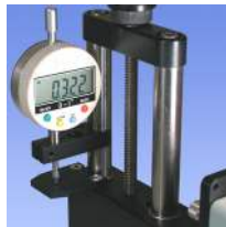
Digital travel indicator