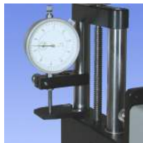
Dial travel indicator