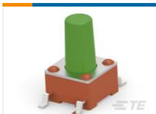
TE Part #2-1977223-4 FSM8JSMASR=6MM TACT SWITCH, SMT 160gf,