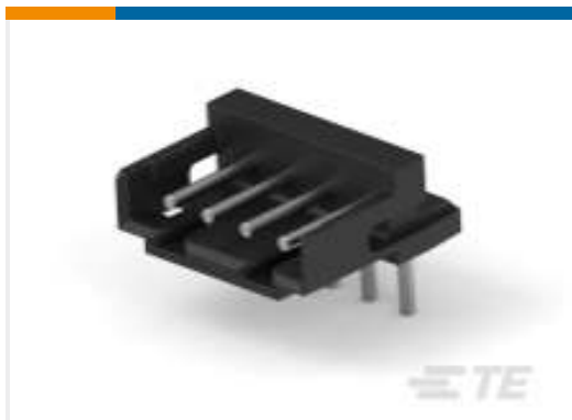
TE Part #292253-4 CT 2mm Header Assembly: Right Angle