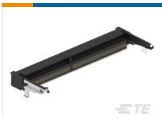
TE Part #2309411-5 DDR4 SODIMM 260P 8.0H STD