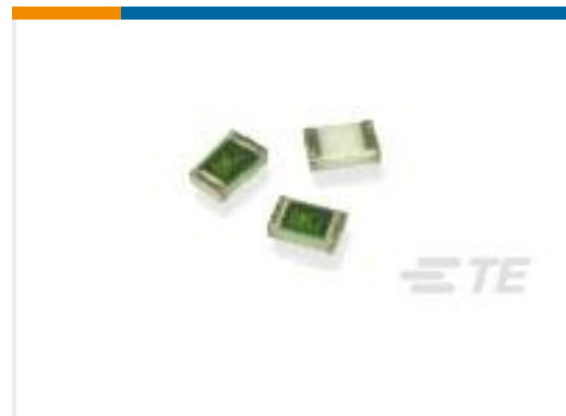
TE Part #9-2176091-6 RP 2A 0.25W 590R 0.1% 25PPM 1K RL