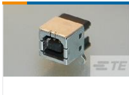
TE Part #292304-2 STD USB TYPE B, R/A, T/H