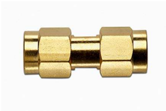
Model 72964 SMA PLUG (M) / PLUG (M)

High bandwidth, small size, and durability for confident connections.