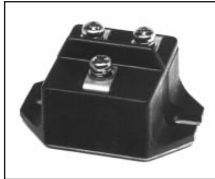
CN24_ _020N, CC24_ _020N Super Fast Recovery Dual Diode Modules 20 Amperes/300-600 Volts