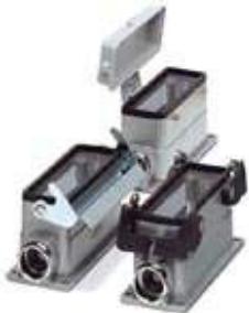
Box mounting base, with double locking latch, height 67 mm, with screw connection, 1x Pg21

Please be informed that the data shown in this PDF Document is generated from our Online Catalog. Please find the complete data in the user's documentation. Our General Terms of Use for Downloads are valid ( http://download.phoenixcontact.com )