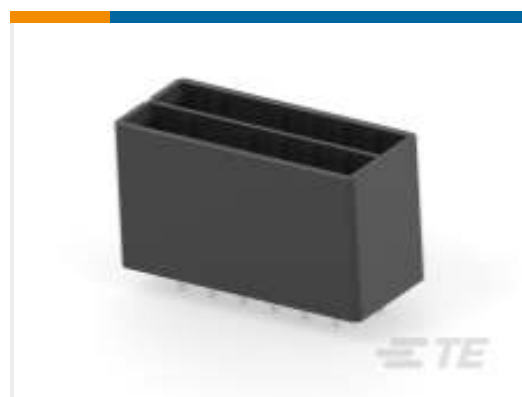
TE Part #1-917337-2 Header Assembly: Wire-to-Board, 15A, gold or tin plated