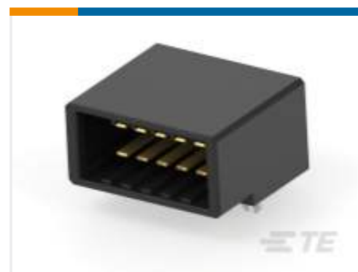
TE Part #178325-2 Header Assembly: Wire-to-Board, 15A, gold or tin plated