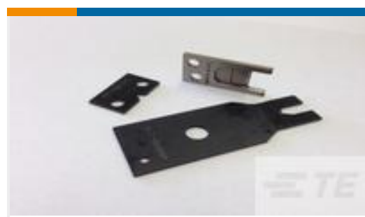
TE Part #2217206-1 Blade, Slug