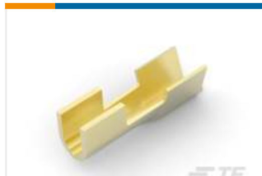
TE Part #1438246-3 B67AA-M104A0