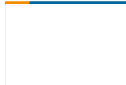
TE Part #517518-5 AUFNAHMEBOLZEN