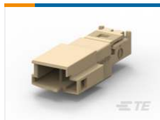
TE Part #2203701-1 2POS, MCON 1.2 CB TAB 2p TL UNSEALED