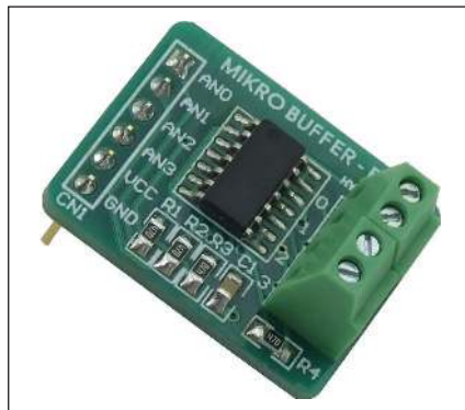
Figure 1: mikroBuffer PROTO board