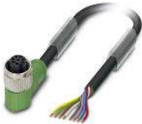
M12 socket, angled, 8-pos., with connected master cable, for sensor/actuator box with M8 slots, cable length: 5 m

Please be informed that the data shown in this PDF Document is generated from our Online Catalog. Please find the complete data in the user's documentation. Our General Terms of Use for Downloads are valid ( http://phoenixcontact.com/download )